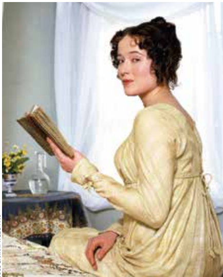
Pride and Prejudice 1995 classic in the "Happy 250th, Jane Austen!" collection