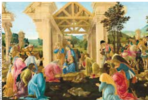
BOTTICELLI, C. 1476

W e know Gustav Mahler as one of the top composers of large-scale orchestral song cycles and symphonies, but he did write some chamber music as well. One work that survives is a piano quartet movement he wrote in 1876 when he was 16 years old. It received a private performance that year and then was lost until his widow Alma Mahler found it in 1964 and had it performed. On Front Row Washington on December 8, we'll hear the piece performed by German piano ensemble Fauré Quartet from their November 2024 performance at Dumbarton Concerts. Also featured is a work by their namesake, Gabriel Fauré — Piano Quartet No. 1 in C minor, Opus 15 — as well as Brahms' Piano Quartet No. 1 in G minor, Opus 25 . Tune in Mondays for local concert recordings on Front Row Washington .