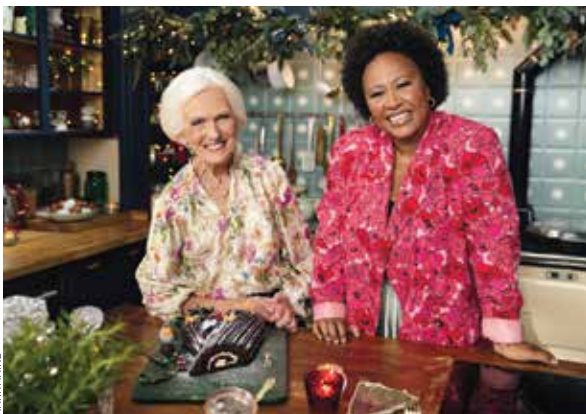
Mary Berry's Highland Christmas in the "Fireside Favorites" collection