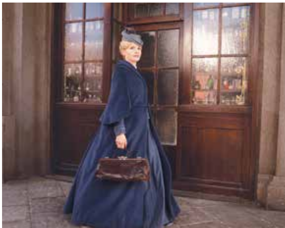
SEVERIDIAN, MISS SCARLET LIMITED & MASTERPIECE