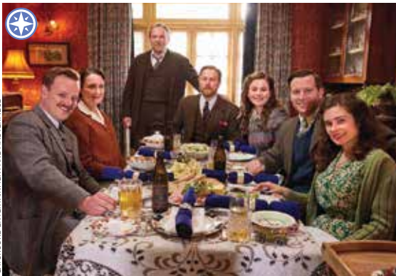
PLAYGROUND ENTERTAINMENT AND MASTERPIECE

Sundays, Dec. 14-Jan. 4 at 9 p.m. on WETA PBS & WETA Metro With new episodes of All Creatures Great and Small on Masterpiece set to premiere in January, WETA reprises Series 5 in double features on Sunday nights starting Dec. 14 for catch-up viewing.