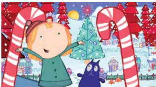
PEG-CAT

W ETA PBS Kids programming this month includes holiday specials, and among the offerings is perennial favorite Peg+Cat+Holidays , a one-hour program featuring Hanukkah and Christmas segments — and penguins! In the storylines, our heroes make dreidels with Albert Einstein and help him save his Hanukkah, and aid Santa Claus in wrapping and delivering presents. And the duo must coach a team of skiing penguins. Additional seasonal specials include Arthur's Perfect Christmas and Wild Kratts Creature Christmas . Visit weta.org/schedule for airtimes. WETA PBS is devoted to children's educational programming weekdays 8 a.m.-3 p.m. and Sunday mornings. For 24 hours of children's programming each day, tune in to the WETA PBS Kids channel.