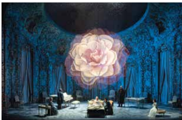
Verdi's La Traviata

In each week's opera presentation, Met commentators expertly guide listeners through the broadcast. Check wetaclassical.org weekly for updated airtime and program information, as start times may vary and Met schedule adjustments may be made. Tune in and enjoy world-class opera performances each Saturday!