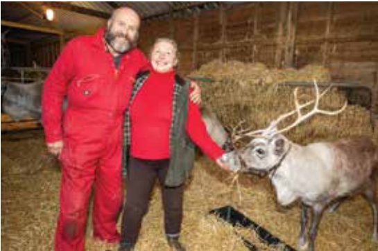
Christmas in the Cotswolds