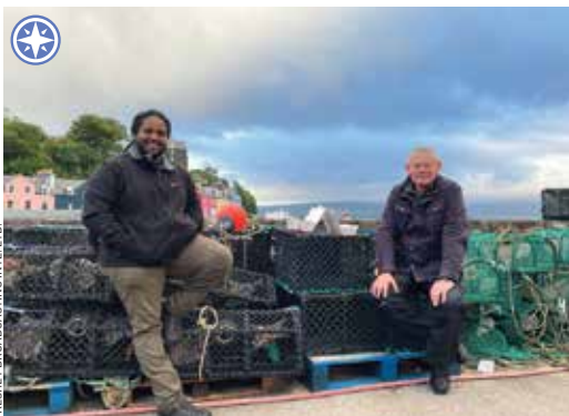
KESHET BROADCASTING INT'L LTD.

the European travel expert traces Florence's bold "rebirth" after Europe's medieval struggles; marvels at the churches, palaces, fountains and canvases of the Baroque period; and examines Impressionist works of the late 1800s. Join Steves on location as he celebrates some of history's most renowned artists and their incredible works.