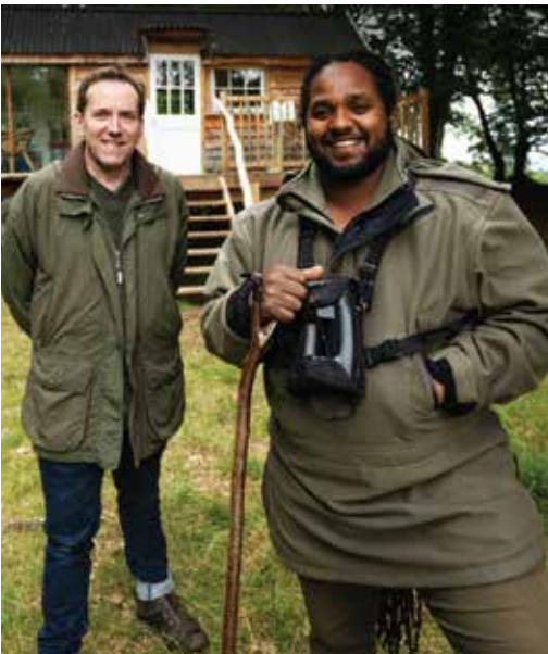
Scotland: Escape to the Wilderness

• Polar Park — Binge the 6-part French drama series, available now. A Parisian crime novelist with writer’s block seeks answers about his past but is pulled into a series of murders staged as famous works of art. Teaming up with a police officer, he faces a cunning killer who taunts them with cryptic clues. In French with English subtitles.