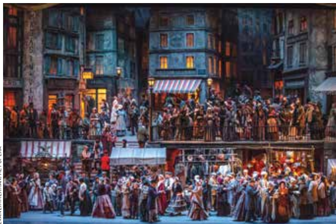
Puccini's La Bohème

Saturdays at 1 p.m. starting December 6 on WETA Classical