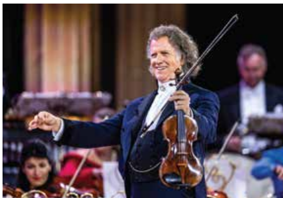
ANDRÉ RIEU PRODUCTIONS

9:30 ANDRÉ RIEU: POWER OF LOVE – Recorded live at the Vrijthof Square in Maastricht, Netherlands in 2024, this performance features the violinist and ensemble