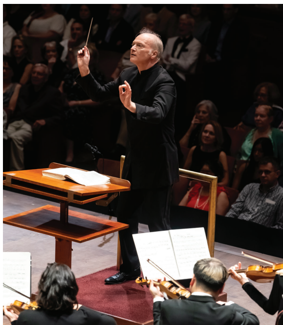
Maestro Noseda leads the National Symphony Orchestra