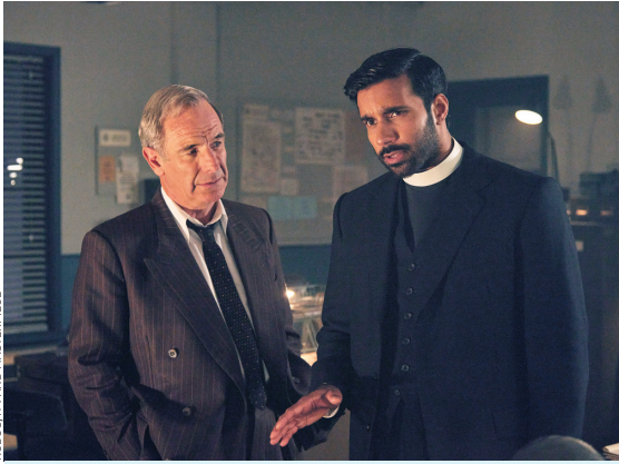
KUDOS: ITV AND MASTERPIECE