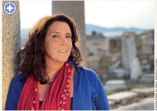
SANDSTONE GLOBAL PRODUCTIONS

English author and presenter Bettany Hughes, a historian of classical antiquity and host of an extraordinary portfolio of documentary films, investigates the most remarkable treasures of civilization that reveal the story of humanity. In the six episodes of Treasures (Series 1), Hughes travels across the ancient world, visiting Greece, Malta, Gibraltar, Mediterranean islands, Istanbul and the Arabian Peninsula, exploring shipwrecks, temples and much more, and unearthing finds from unfolding excavations. The 2021 series — which spotlights places and objects and traces their significance within human history — is armchair traveling at its most vivid, championing what ordinary people throughout time have achieved through the sheer force of will, inspiration and collaboration. Binge-watch the series with WETA Passport.