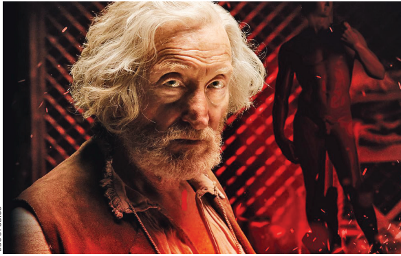
Charles Dance as Michelangelo