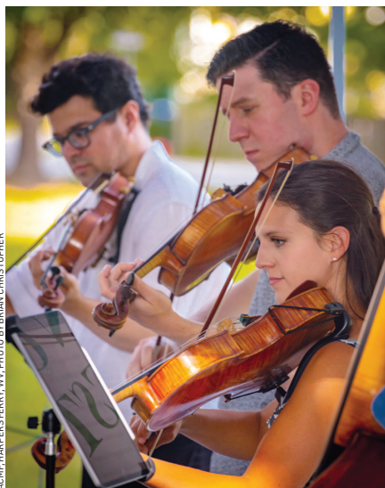
ACMF, HARPER'S FERRY, WV.