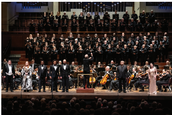
The NSO, choirs and soloists perform Otello

WETA Classical’s NSO Showcase is the next best thing to having a seat at the stunning live performance. Take it from the Washington Classical Review : “Noseda is...an Italian opera guy...he likes grace...but he also gets drama. The result was scintillating, edge-of-the-seat Verdi, played throughout with an extra awareness of just how beautiful the score really is.”