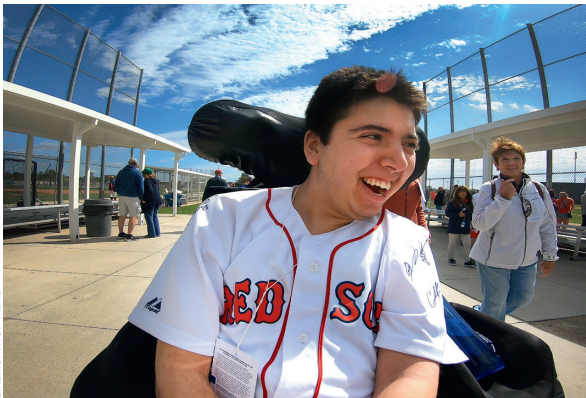
POV: The Ride Ahead

POV: Made in Ethiopia (July 14, 10 p.m.) • As a massive Chinese-run factory complex attempts a high-stakes expansion in rural Ethiopia, three