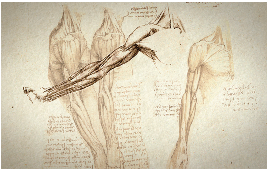
Drawing of an arm, by Leonardo da Vinci

of the most brutal periods in history. The series features actor Charles Dance ( The Jewel in the Crown ; Game of Thrones ) as the great artist Michelangelo; Sophie Okonedo narrates. The Renaissance was a time of power politics, upheaval, betrayal and bloodshed, yet it was also a time of unparalleled creativity. This miniseries takes Michelangelo as its guide and reveals how he navigated the violent reality of the times — and how his life intersected with two other geniuses of the era, Leonardo da Vinci and Raphael. Renaissance: The Blood and the Beauty blends expert interviews, dramatic reconstructions and immersion in wondrous works of art.