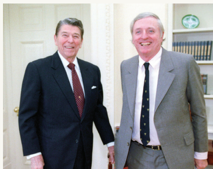
REAGAN AND BUCKLEY IN THE OVAL OFFICE

Throughout July, WETA World features weekday afternoon, feature-length, acclaimed biographies of renowned thinkers and leaders on the American political landscape. The series American Masters at 3 p.m. spotlights U.S. Senator Daniel Patrick Moynihan (July 7); conservative intellectual, writer, and Firing Line founder-host William F. Buckley Jr. (July 8); Governor Jerry Brown (July 9) and American attorney and First Amendment champion Floyd Abrams (July 10). Later in the month, the channel presents 3 p.m. American Experience comprehensive biographies of U.S. presidents Jimmy Carter (July 23), Ronald Reagan (July 28-29) and Lyndon Baines Johnson (July 30-31).