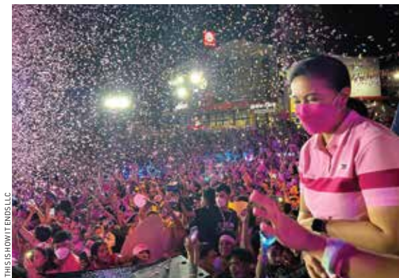
THIS IS HOW IT ENDS LLC