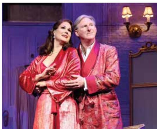
Stephanie J. Block and Adrian Dunbar in Kiss Me, Kate