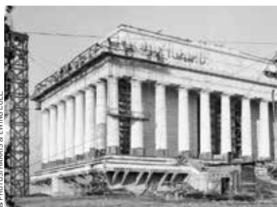
LIBRARY OF CONGRESS PRINTS & PHOTOS; HARRIS & EWING COLL.

Stream episodes at weta.org/signaturedish . For more on the restaurants and dishes featured, visit restaurants.wetaguides.org . Follow the series via @signaturedishbc on Instagram.