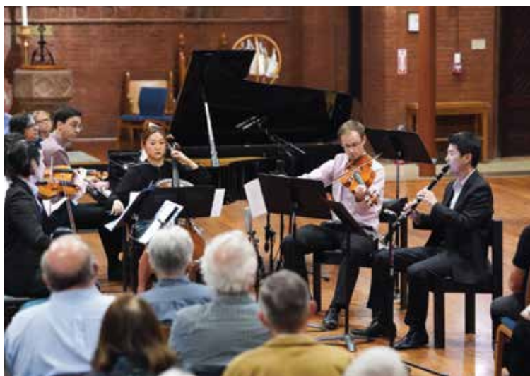
D.C.-based Chiarina Chamber Players

For more discoveries and inspiration surrounding our area's vibrant classical music offerings, check out WETA Classical's blog classicalscore.org — a rich resource for concert previews and in-depth articles on music and musicians. From world-class orchestras at George Mason Center for the Arts to chamber music at the Library of Congress, to summer at Wolf Trap and at so many other local venues, we enjoy a banquet of artistic choices in the national capital area. Here at WETA Classical, we wish you bon appétit!