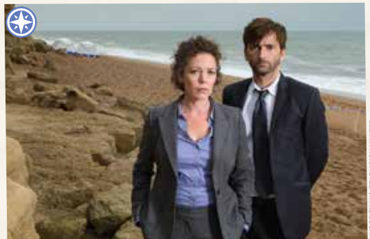
KUDDUS FILM & TELEVISION LIMITED

In the Peabody Award-winning drama, when an 11-year-old boy is murdered, the small town of Broadchurch on England's Dorset coast suddenly becomes the focus of a major criminal investigation in the full glare of the media spotlight. Newly arrived police team leader DI Alec Hardy (David Tennant) and his associate, local policewoman DS Ellie Miller (Olivia Colman), head the case, as the town's community members are drawn into the police inquiry, starting with the immediate family and then radiating outward. The powerful 2013 series explores the impact of the crime, including grief, loss and mutual suspicion as the police seek the killer. Jodi Whittaker and Andrew Buchan co-star.