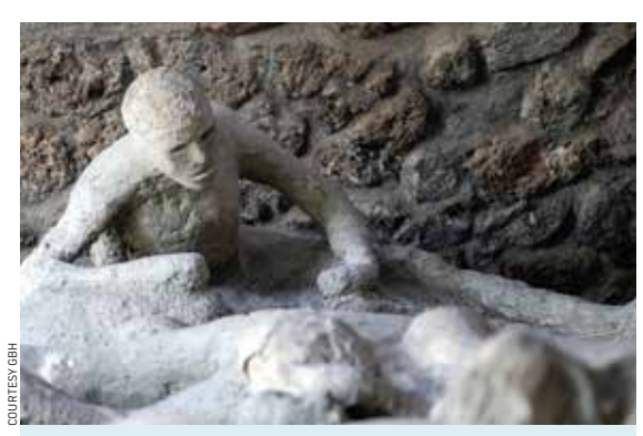
Wednesday, Feb. 19 at 9 p.m. on WETA PBS & WETA Metro NOVA: Pompeii's Secret Underworld spotlights archaeological finds that now reveal a darker and more complex picture of society in the ruined city once hailed as a jewel of the Roman Empire.

10:00 FRONTLINE: BATTLE FOR TIBET – Frontline investigates China's rule over Tibet. With footage from inside the region, Frontline explores how the Communist regime