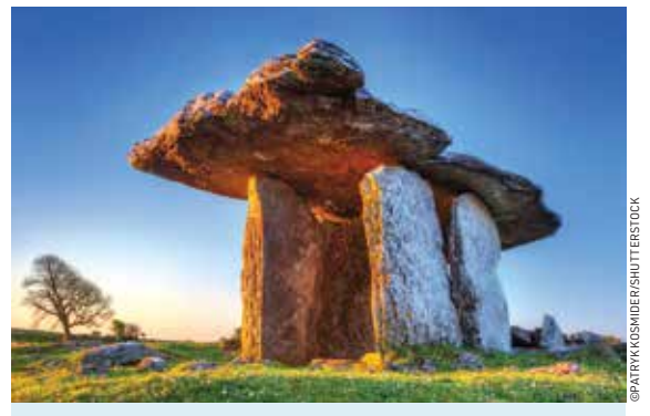
Wednesday, Feb. 26 at 8 p.m. on WETA PBS & WETA Metro Nature: Wild Ireland: Kingdom of Stone journeys through a landscape called the Burren (in County Clare), home to some of Ireland's most enchanting wildlife, including the pine marten.

8:00 ANTIQUES ROADSHOW: LIVING HISTORY FARMS, HOUR 2 – See remarkable finds from Roadshow 's stop in Iowa and guess which appraised for $70,000 to $90,000, among a 1967 NFL Championship "Ice Bowl"