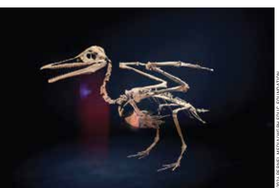
Wednesday, Feb 5. at 9 p.m. on WETA PBS & WETA Metro NOVA: Dino Birds explores why birds proved resilient, surviving the mass extinction asteroid event to become the only dinosaurs still alive today. Scientists examine rare fossil evidence that reveals the secrets of bird evolution going back 100 million years.