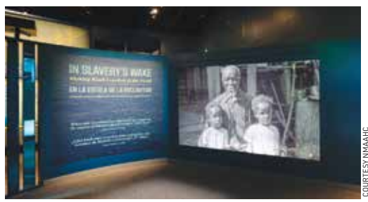
The National Museum of African American History and Culture

his month on WETA Arts , tour the National Museum of African American History and Culture's new exhibit, "In Slavery's Wake: Making Black Freedom in the World." Ten years in the making, the exhibition focuses on the worldwide impact of European slavery and colonialism.