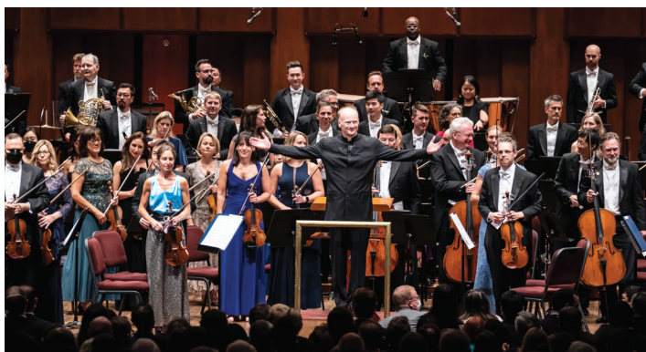
Music Director Gianandrea Noseda and the National Symphony Orchestra in the 2022 Season Opening Gala Concert

gala concert in all its excitement, Wednesday morning, October 2 at 11 a.m. The highlight of the concert, recorded Sept. 28, is a performance by Yunchan Lim, the youngest-ever Van Cliburn International Competition gold medalist, of one of the world's masterpieces: Rachmaninoff's Piano Concerto No. 2 . The electrifying young artist, billed by the Kennedy Center as "classical music's newest rock star," is making his NSO debut.