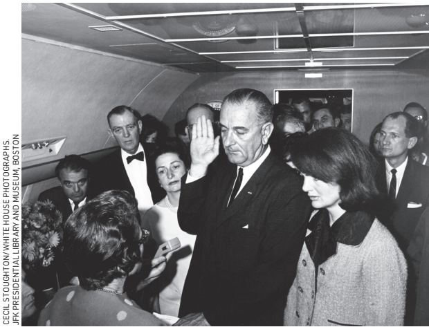
LBJ taking the oath of office on Air Force One in 1963