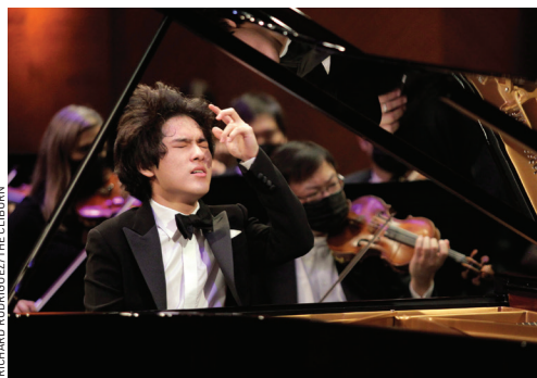
Gala soloist Yunchan Lim performing in the 2022 Cliburn competition