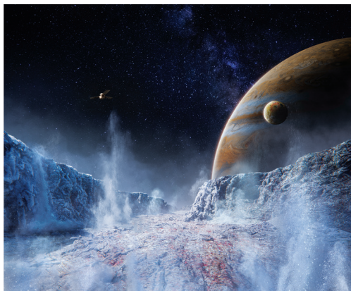
BBC STUDIOS & LUX AETERNA

A new five-part NOVA miniseries starting October 2 explores extraordinary natural phenomena across the solar system, where volcanoes are erupting, storms are raging, and ice is acting in strange ways. And surprises like these aren't limited to planets: our solar system is home to myriad fascinating smaller bodies, including moons, asteroids and comets. In recent decades, space missions have brought these neighboring worlds into sharp focus. Now, using the latest scientific imagery and remarkably realistic animations, planetary scientists present a journey across the solar system to uncover new revelations about our celestial neighborhood. Episodes are Storm Worlds (Oct. 2); Strange Worlds (Oct. 9); Volcano Worlds (Oct. 16); Icy Worlds (Oct. 23); and Wandering Worlds (Oct. 30) — each at 9 p.m. on WETA PBS and WETA Metro.