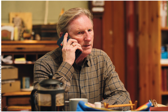
RIDLEY-WEST ROAD PICTURES & A3MI