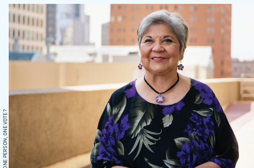
ONE PERSON, ONE VOTE?

Stream at weta.org/livestream or via the PBS app