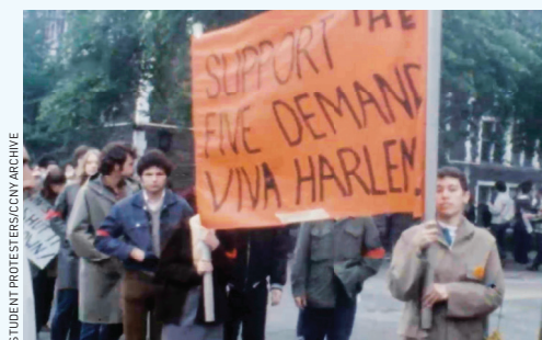
STUDENT PROTESTERS

Democratic Party elder, above) representing different parties in Colorado during the 2020 election. In addition to the electors' journeys, the film provides context about the Electoral College's origins and offers a nonpartisan understanding of the institution and its centrality to questions of the modern day.