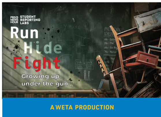
PBS NEWS HOUR SRL

Monday, Oct. 14, 9:30 p.m. on WETA PBS; 8:30 p.m. on WETA Metro Run, Hide, Fight: Growing Up Under the Gun , a documentary from student journalists of PBS News Hour Student Reporting Labs, explores the impact of gun violence on young Americans.