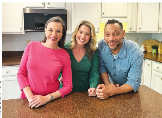
LIZZIE ALBERS FOR WETA