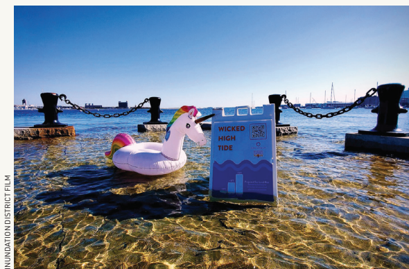
INUNDATION DISTRICT FILM

In a special film, documentary series Local USA explores how, in a time of rising seas and intensifying storms, Boston, one of the world's wealthiest, most-educated cities, made a fateful decision to spend billions of dollars erecting a new district along its coast on landfill at sea level. Unlike other places imperiled by climate change, this neighborhood housing some of the world's largest companies was built well after scientists began warning of the threats. The city, which already has more high-tide flooding than most in the USA, called its new quarter the Innovation District. But with seas rising, others are calling the neighborhood "Inundation District."