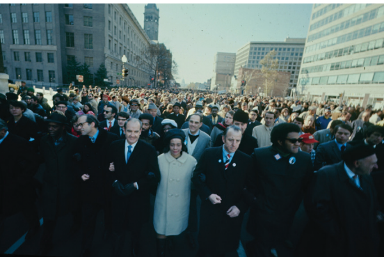
Saturday, August 17 at 7:30 p.m. on WETA PBS American Experience: The Movement and the Madman spotlights 1969 Vietnam War protests. Above: Coretta Scott King leads a Washington, D.C. march with U.S. senators McGovern and Goodell.