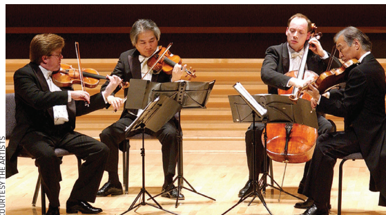
Chamber Music: The former Tokyo String Quartet in concert

Visit ClassicalScore.org to learn more and explore!