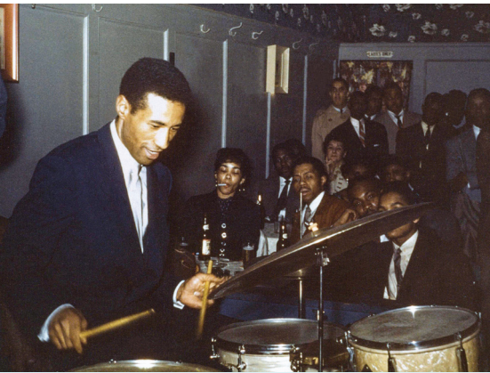
1950s

Saturday, August 24 at 7:30 p.m. on WETA PBS American Masters: Max Roach: The Drum Also Waltzes explores the extraordinary life, groundbreaking sounds, and activism of the jazz drummer, bebop pioneer and virtuoso composer.