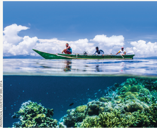
INDONESIA COURTESY BBC 2014

A three-part miniseries explores some of the most extraordinary places on the planet, visiting six continents to learn how these natural wonders evolved and hear rarely told stories about the challenges that local inhabitants face. Extreme Wonders , Wonders of Water and Living Wonders , respectively, visit extreme locations, from Mount Everest to the Grand Canyon to Mount Kilimanjaro; spotlight wonders created by the power of water, including Victoria Falls and ocean reefs; and illuminate wonders created by life itself, including an extraordinary rite of passage in the Amazon and the risky endeavors of honey gatherers in Bangladesh.