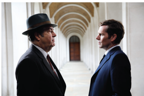
MANMOTH SCREEN AND MASTERPIECE

After the conclusion of Series 8 of Endeavour , WETA brings back the final season (Series 9) of the beloved Oxford-set mystery drama, which wraps up the storyline. In these last episodes, young detective Endeavour Morse (Shaun Evans) and his father-like mentor Fred Thursday (Roger Allam) dig into their final harrowing investigations together. In the three episodes of Series 9 — Prelude , Uniform and Exeunt — it is Spring 1972 and DS Morse rejoins the force after an extended leave resulting from overwork and personal troubles. Morse is immediately immersed in a world he loves — orchestral music — but also must probe a gangland slaying targeting a police informant. With growing dread, Morse and Thursday face the prospect that an old unresolved case has resurfaced. As the loose ends intertwine, new deaths occur, the romantic plot involving Joan Thursday accelerates, and the drama comes to its poignant close.