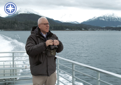
SHOW OF FORCE

Stream at weta.org/livestream or via the PBS App