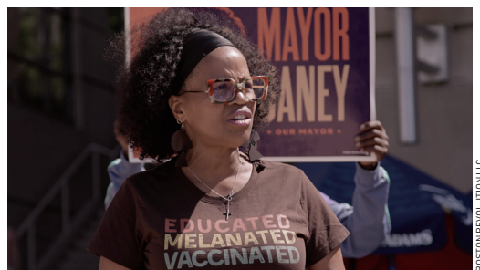
Kim Janey speaking at a campaign rally

A 90-minute documentary spotlights Boston, a racially complex American city, as it confronts its past, present and future. The film tracks the 2021 mayoral race in which four non-white women were the leading contenders. Framed by the appointment of Acting Mayor Kim Janey, the first female Black mayor of a city that has been run by white men for 200 years, the program shows a side of Boston that is rarely portrayed in mainstream media. Janey, busied as a child to hostile neighborhoods, ushered in historic change. The film draws parallels to our nation as a whole.