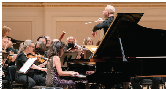
Piano Concerto: Beatrice Rana & Yannick Nézet-Séguin perform with the Philadelphia Orchestra