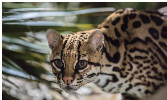
Wednesday, August 28 at 8 p.m. on WETA PBS & WETA Metro Nature: American Ocelot examines the past, precarious present and possible future for one of the country's most endangered wild cats. Above: An ocelot at The Texas Zoo in Victoria, Texas.

WETA Magazine is published monthly by the Greater Washington Educational Telecommunications Association for its members. Three dollars of each member's dues are designated for its subscription. WETA occasionally exchanges member names with other organizations. If you wish that your name not be exchanged, please call Audience Services at 703-998-2724. ©2024 by Greater Washington Educational Telecommunications Association. All rights reserved. No part of this magazine may be reproduced in any form without written permission. Periodical postage paid at Arlington, VA 22210 and additional offices. Send address changes to WETA, 3939 Campbell Avenue, Arlington, Virginia 22206. Volume 37, Number 8. ISSN No. 1041-2700.