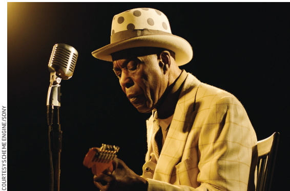
Saturday, August 10 at 10:30 p.m. on WETA PBS American Masters: Buddy Guy: The Blues Chase the Blues Away spotlights the blues master, one of the most influential guitarists of all time and a pioneer of the Chicago electric blues sound.