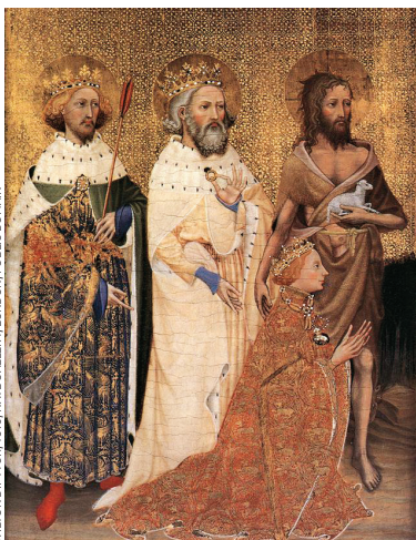
WILTONDIPTYCH, 1395, NATL. GALLERY, LONDON; PUBLIC DOMAIN