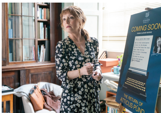
Sundays at 9 p.m. starting Aug. 11 on WETA PBS & WETA Metro WETA reprises Masterpiece mystery drama Maggie Murders in anticipation of a sequel series slated to premiere September 15. Lesley Manville stars as a sleuthing book editor.