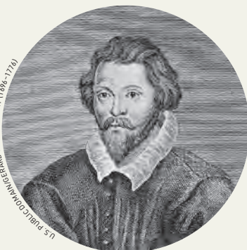
Composer William Byrd

On Sunday, October 22, WETA Classical program Choral Showcase marks the 400th anniversary of the death of William Byrd (c. 1540-1623), one of the most influential and inventive artists of the Renaissance — and one of England’s greatest composers. That he managed to create music of such power and beauty during a time of great social, political, and religious upheaval is no small feat. Among his most sublime works are the masses for three, four, and five voices; Choral Showcase features two, along with anthems and madrigals drawn from new albums of Byrd’s music released during this anniversary year by The Gesualdo Six, The King’s Singers, and Fretwork. In other Choral Showcase programs this month, enjoy music by Mozart and his contemporary Marianna Martines (Oct. 1); music from the New World (for Indigenous Peoples’ Day) (Oct. 8); and American choral music (Oct. 29). Tune in to Choral Showcase each Sunday at 9 p.m.