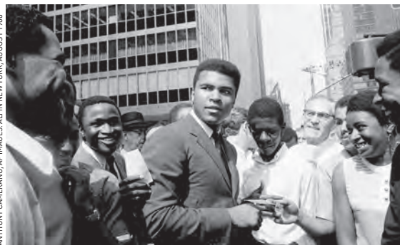
MUHAMMAD ALI A WETA CO-PRODUCTION

6:00 PBS NEWS WEEKEND —John Yang anchors. Repeats Monday, 7am