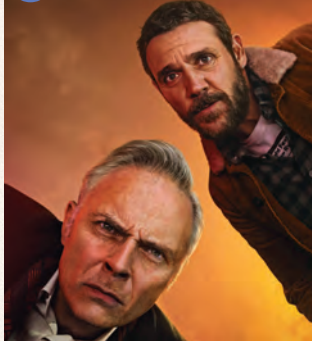
EXPECTATION/HAPPY TRAMP NORTH 2019