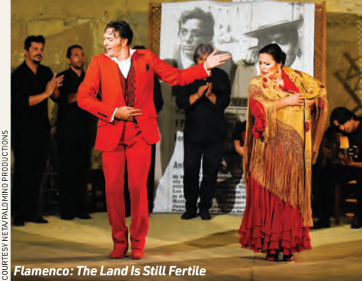
Flamenco: The Land Is Still Fertile

Continuing the ongoing celebration of Hispanic Heritage Month (mid-September – mid-October), WETA World this month presents more than 20 special themed programs — visit weta.org/hispanicheritage for program listings and airtimes. Among the offerings are the acclaimed three-part biographical film Becoming Frida Kablo (Friday, October 6, 7-10 p.m.), spotlighting the iconic Mexican artist; the documentaries America ReFramed: We Like It Like That (Sunday, October 8 at 5 p.m.), exploring the story of Latin Boogaloo music, and The Last Mambo (Sunday, October 8 at 7 p.m.), illuminating the heritage and influence of the San Francisco Bay Area Salsa and Latin Jazz community; in addition to four-part cultural series Flamenco: The Land Is Still Fertile (Sundays, October 15 & 22, 7-8 p.m.), which celebrates the passionate art form through performance, interviews and history.