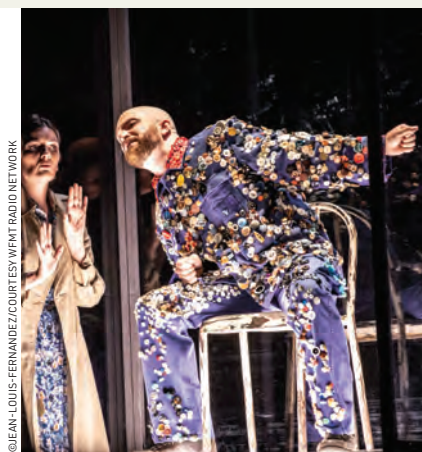
George Benjamin's Picture a Day Like This

A charming fairytale opera, in two plots, challenges the distinctions of imagination and reality and explores the human condition through the flow of music. The chamber opera Picture a Day Like This , written for intimate setting with five singers and small orchestra, premiered in 2023 and is sung in English. This production of the Aix-en-Provence Festival, airing October 14 on WETA Classical’s Opera Matinee , is led by the opera’s composer, George Benjamin, and features the Mahler Chamber Orchestra. Soloists include Marianne Crebassa. To learn about additional October operas, visit wetaclassical.org . Tune in to Opera Matinee each Saturday at 1 p.m. on WETA Classical.