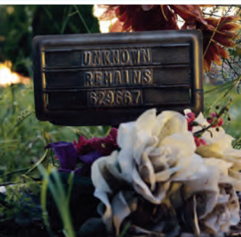
MIGRANT REMAINS: CEMETERY MARKER FOR UNIDENTIFIED MIGRANT, BROOKS COUNTY, TX

the man and the cultural context in which his considerable celebrity unfolded. The film conveys Ali's story with its full range of contradictions, both personal and professional. For details about the film, visit pbs.org/ali .