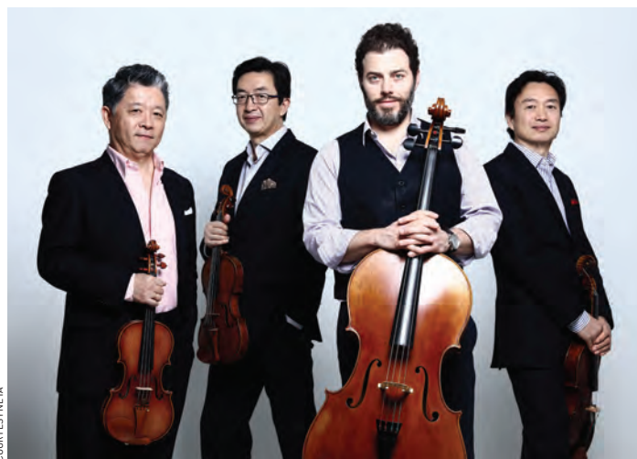
Shanghai Quartet circa 2019

A string quartet consists of two violins, viola and cello, and is led by the first violinist. (There is a