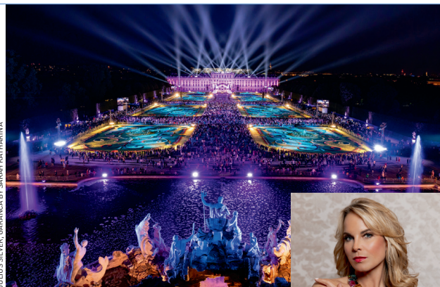
GARANČA

On August 25, enjoy the Vienna Philharmonic Orchestra's annual open-air Summer Night Concert , which this year features guest soloist mezzo-soprano Elina Garanča under the direction of guest conductor and Metropolitan Opera music director Yannick Nézet-Séguin. The concert takes place in the gardens of Austria's Imperial Schönbrunn Palace. The programme includes music from Bizet's Carmen , Gounoud's Sapho , and Saint-Saëns Samson et Dalila , along with works by Ravel, Berlioz and others. The concert also airs August 25 at 9 p.m. on WETA Metro.