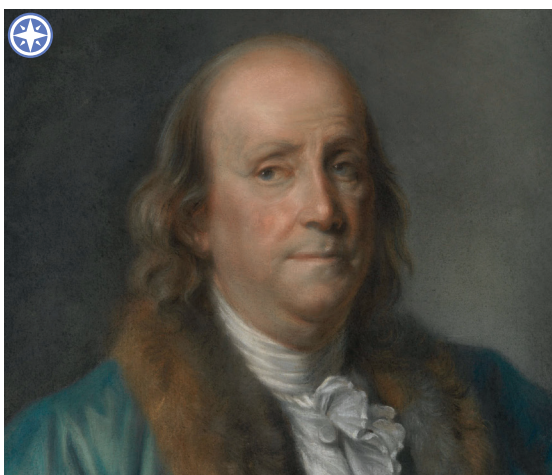
BENJAMIN FRANKLIN A WETA CO-PRODUCTION

Program special All Creatures Great and Small: Chapter Three goes behind the scenes of the charming Masterpiece series with its cast and creators. Learn how the series takes viewers back in time.