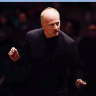
NSO Music Director Gianandrea Noseda