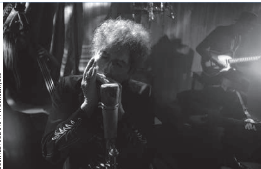
BOB DYLAN IN CONCERT, 2021

The program presents Dylan performing 21st-century versions of songs from his storied back catalog, including gems such as “Queen Jane Approximately” and “Wicked Messenger.” The earliest composition in the set list is fan favorite “It’s All Over Now, Baby Blue” from the 1965 album Bringing It All Back Home , and the most recent is “What Was It You Wanted” from 1989’s Oh Mercy . In addition to Dylan, who plays guitar and harmonica and sings, the song arrangements include two additional guitars, a bass, and an accordion, with a performance of “Forever Young” featuring a dolceaola. The special also includes excerpts from Bob Dylan: The 30th Anniversary Celebration .