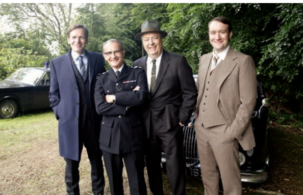
Prior to the final three episodes of Endeavour , the special program Morse & The Last Endeavour on Masterpiece , a documentary looking back at Endeavour , airs Sunday, June 11 at 9 p.m. on WETA PBS and WETA Metro.

overwork and personal troubles. Morse is immediately immersed in a world he loves — orchestral music — where the performances are divine, but the personnel can be petty, dictatorial and even homicidal. He and Thursday also investigate a gangland slaying targeting a police informant, known to Thursday. As viewers have learned to expect, the cases in Oxford are often connected. With growing dread, Morse and Thursday face the prospect that an unresolved case (from a previous season) has resurfaced. Now the loose ends begin to intertwine. In the episodes that follow, previous investigations reemerge, new deaths occur, the romantic plot involving Joan Thursday accelerates, and the beguiling, intelligent drama comes to a close. Farewell Morse!