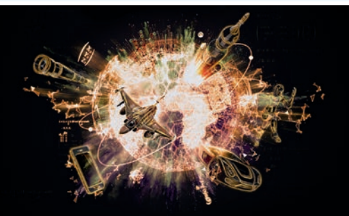
BIGGER BANG COMMUNICATIONS LTD

played a dangerous game and paid a high price; but they also changed British history, leaving Queen Elizabeth I, daughter of Anne, and Queen Elizabeth II, a Boleyn descendant, as legacies.