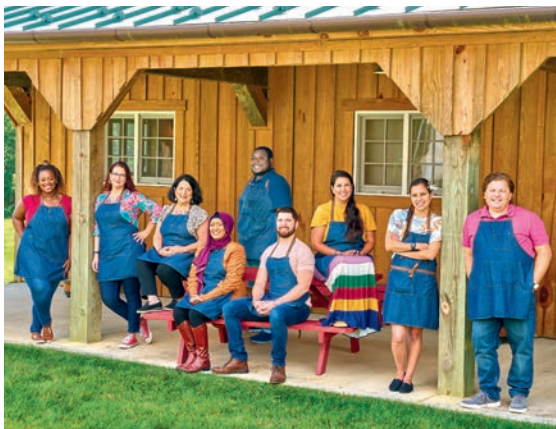
Mondays at 10 p.m. on WETA PBS, 9:30 p.m. on WETA Metro The Great American Recipe, Series 2 , premiering June 19, features new culinary competition as contestants showcase their creations. Episodes repeat Fridays at 9 p.m. on WETA PBS and WETA Metro.