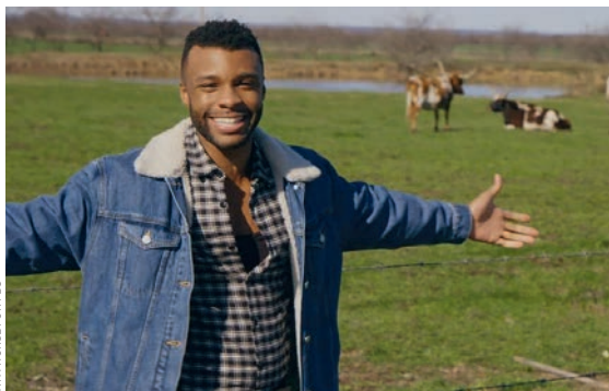
TINYHORSE FOR PBS

9:30 LEWIS, SERIES 2: THE GREAT AND THE GOOD – Lewis and Hathaway track down the prime suspect in the assault of a teenage girl, but he has a seemingly