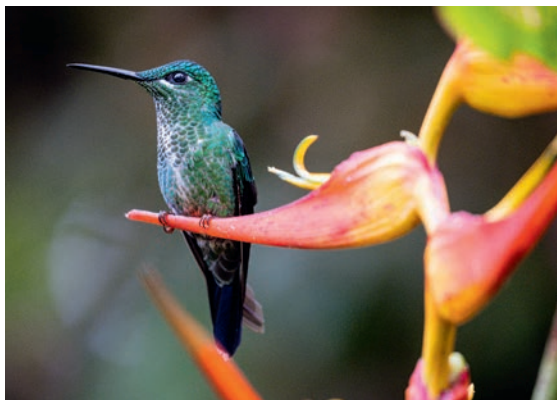
FEMALE GREEN-CROWNED BRILLIANT HUMMINGBIRD.

9:30 THE JEWISH JOURNEY: AMERICA – A program traces Jewish immigration to the U.S. through the centuries. Top scholars, notable writers and immigrants