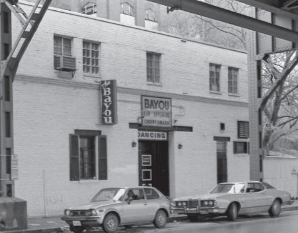
THE BAYOU, 1977.