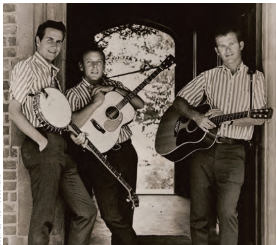
Friday, Dec. 2 at 10 p.m. on WETA PBS

John Sebastian Presents: Folk Rewind features the pop music artist in a special featuring the greatest singers and songwriters of the classic '50s & '60s folk era, including (above) The Kingston Trio.