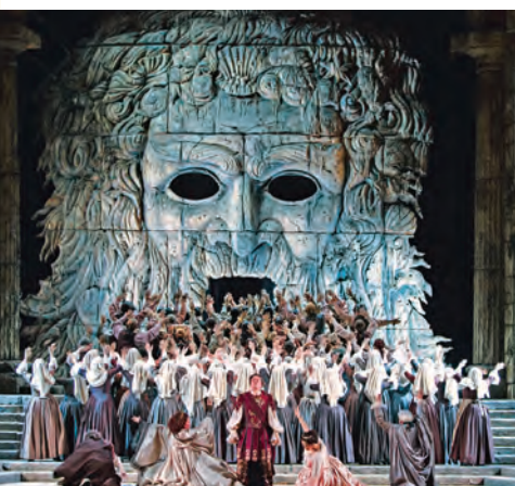
A scene from Mozart's Idomeneo

In other exciting presentations, renowned soprano Sondra Radvanovsky sings the title role of Cherubini's rarely performed Medea (Jan. 7), from a recently recorded Met premiere; and Terence Blanchard's Champion (May 27), the story of boxer Emile Griffith, features Ryan Speedo Green and Eric Owens in another Met premiere conducted by Maestro Nézet-Séguin.