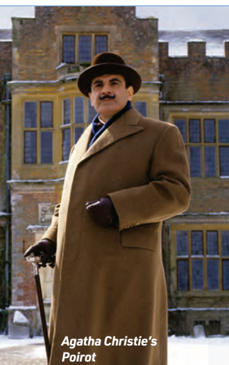
Agatha Christie's Poirot

Agatha Christie dramas take center stage on Thriller Thursdays in December. The 2018 drama Agatha and the Truth of Murder (Dec. 8, 8 p.m.) features Ruth Bradley portraying Christie investigating a prominent murder. The next week, the 1981 adaptation Agatha Christie's Seven Dials Mystery (Dec. 15, 9 p.m.) follows a young aristocrat who probes murder, stolen state secrets, and a mysterious secret society. Cheryl Campbell, John Gielgud and James Warwick star. Then, WETA presents two episodes of Agatha Christie's Poirot , starring David Suchet as the famed Belgian detective: Hercule Poirot's Christmas (Dec. 22, 8 p.m.) features the sleuth as a Christmas guest probing murder; and renowned case Murder on the Orient Express (Dec. 22, 10 p.m.) co-stars Eileen Atkins, Barbara Hershey and Hugh Bonneville. Rounding out the offerings are adaptations Agatha Christie's Why Didn't They Ask Evans? (Dec. 29, 8 p.m.), and Agatha Christie's They Do It With Mirrors (Dec. 29, 9:30 p.m.).