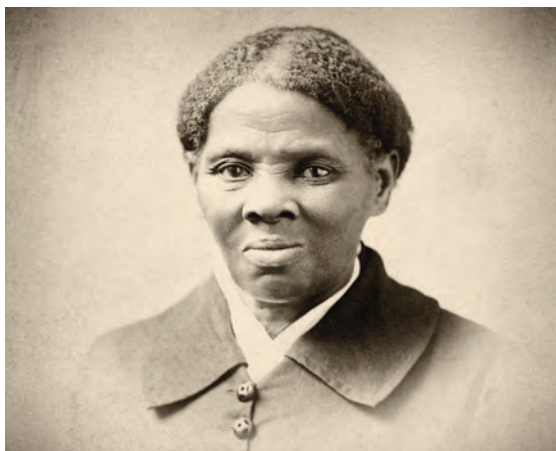
Saturday, Dec. 3 at 8 p.m. on WETA PBS

Harriet Tubman: Visions of Freedom spotlights the inspiring woman, born in Maryland, who repeatedly risked her own life and freedom to liberate others from slavery through the Underground Railroad.