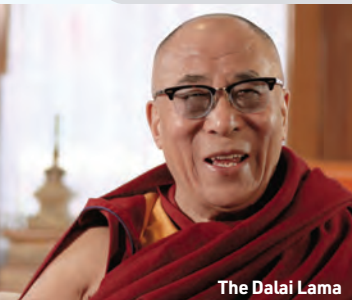
The Dalai Lama