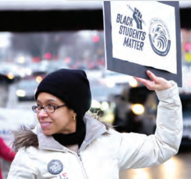
SCHOOL FILM LLC

Stream at weta.org/livestream or via the PBS Video App