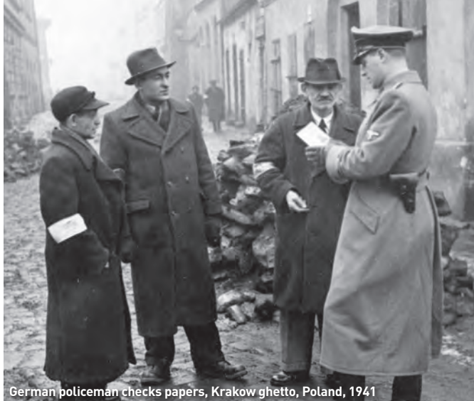
German policeman checks papers, Krakow ghetto, Poland, 1941

LEFT: SOL MESSINGER, RIGHT: COURTESY NATIONAL ARCHIVES IN KRAKOW