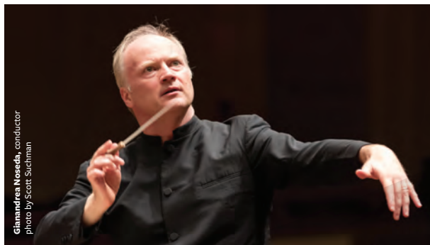
Gianandrea Noseda, conductor

The NSO Season Opening Gala is always a must-see event, especially when one of today's most in-demand artists joins the party! Be part of the excitement as Grammy Award®-winning pianist Daniil Trifonov returns to electrify D.C. audiences with Rachmaninoff's diabolically difficult Rhapsody on a Theme of Paganini .