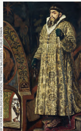
Ivan the Terrible by Victor Vasnetsov

A gallery of rogues, villains, and scoundrels comes to life this month on WETA Classical's weekly broadcast Choral Showcase , beginning with the timeless legend of a man who sells his soul to the devil: The Damnation of Faust (Sept. 4) by Hector Berlioz. Then, from Finland's national epic The Kalevala , comes Kullervo (Sept. 11) by Jean Sibelius — a cautionary tale of a hero gone rogue, with disastrous results. Sergei Prokofiev's cantata Ivan the Terrible (Sept. 18) is drawn from his score for Sergei Eisenstein's epic film; and Henrik Ibsen's falsehearted ne'er-do-well, in Peer Gynt (Sept. 25), is illuminated in the complete music by Edvard Grieg. Join me each Sunday night at 9 p.m. for Choral Showcase on WETA Classical.