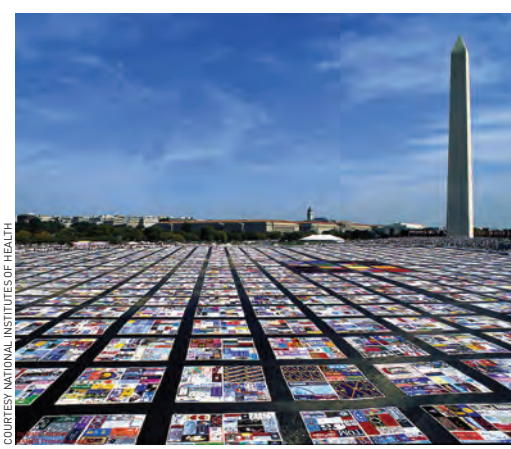
The AIDS Quilt on the National Mall

T his month, public television’s marquee science series continues its 49th season on the air, advancing its mission to make science accessible to viewers so that they can better understand the world around them. In September, two new episodes premiere. The NOVA film Ending HIV in America (Sept. 21) asks, almost 40 years after the discovery of HIV, could we be on the verge of ending the AIDS epidemic in our nation? The program looks back on how scientists tackled one of the most elusive deadly viruses to ever infect humans and explores whether innovative drugs can bring new infections to zero. In the episode Saving Venice (Sept. 28), learn how rising sea levels and sinking land threaten to destroy Italy’s famous city. Leading scientists and engineers are racing against the clock and battling the forces of nature to try to save the historic metropolis. Discover the innovative projects and feats of engineering currently underway, including a high-tech flood barrier, eco-projects to conserve the lagoon, and new efforts to investigate erosion beneath the city.