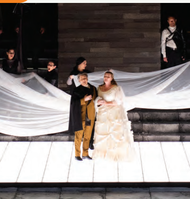
OPERA ROMA/WFMT NETWORK

A drama of deception and revenge opens the lineup of September operas on WETA Classical's Opera Matinee on September 3 with Amilcare Ponchielli's La Gioconda , a production of La Scala. Then, Teatro dell'Opera in Rome on September 10 brings us Vincenzo Bellini's final work, I Puritani , a bel canto masterpiece of conflicted love set against civil war in England. The National Centre for the Performing Arts in China presents the month's remaining operas: Georges Bizet's shimmering drama of friendship threatened by love, The Pearl Fishers , on September 17; and Antonín Dvořák's Rusalka , a charming Slavic fairy tale of a water sprite who experiences human love, on September 24. Tune in for Opera Matinee each Saturday at 1 p.m. on WETA Classical.