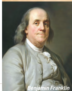
BENJAMIN FRANKLIN BY JOSEPH SIFFERT DUPLESSIS, C. 1786; NATIONAL PORTRAIT GALLERY

Benjamin Franklin • 6:30 p.m.-11:30 p.m. | Ken Burns's two-part 2022 film, a WETA co-production, explores the revolutionary life of one of the 18th century's most consequential figures, whose work and words unlocked the mystery of electricity and helped create the United States.