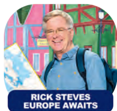
RICK STEVES EUROPE AWAITS

W ETA Passport now features more travel series and specials in its program library, and exciting adventures await you! Among the new additions are popular travel offerings such as Rick Steves' Europe programs featuring tips and cultural explorations from the renowned travel expert; and episodes of Real Rail Adventures , with avid train buff and host Jeff Wilson. Stream these and other travel, adventure and exploration series, including Expedition with Steve Backshall , Islands of Wonder and Earth's Natural Wonders . Visit weta.org/travel to learn more, stream programming with WETA Passport, and embark on a voyage of discovery. Looking ahead, in November, watch for additional travel series streaming opportunities such as Great Scenic Railway Journeys and Born to Explore with Richard Wiese .