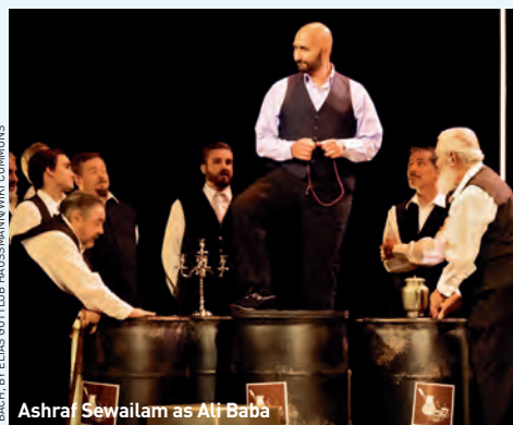
BACH