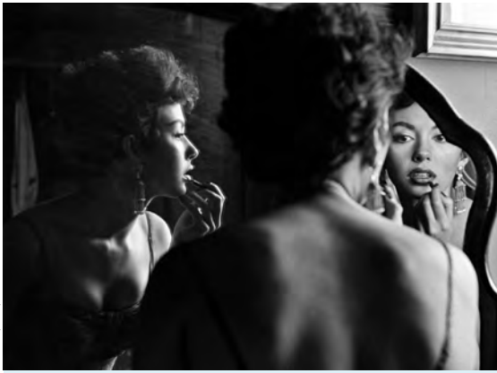
MORENO, 1954.

Tuesday, October 5 at 9 p.m. on WETA PBS & WETA Metro Rita Moreno: Just a Girl Who Decided to Go for It on American Masters explores the trailblazing life and 70-year career of the iconic Latina actor, performer and activist, one of a very select group of winners of the Emmy, Grammy, Oscar and Tony Awards.