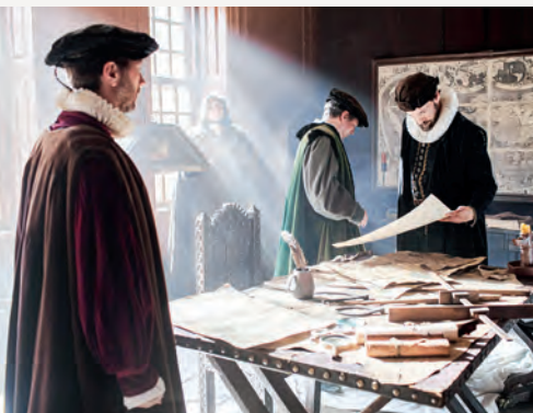
ZDF/GRIS TINA MATEI