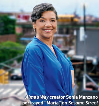
Alma's Way creator Sonia Manzano portrayed "Maria" on Sesame Street

Alma models optimism and determination, demonstrating that she can problem-solve. The series is from Fred Rogers Productions, the non-profit producer of Mister Rogers' Neighborhood and contemporary children's series Daniel Tiger's Neighborhood , Donkey Hodie and Odd Squad . Each episode of Alma's Way showcases different aspects of Latino cultures through language, food, customs and vibrant music. The show is produced, written and directed by a diverse team, and Latino voices are imbued throughout the series, both on screen and behind the scenes in the production and writing team.