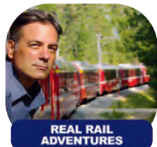
REAL RAIL ADVENTURES

Stream the new four-part documentary Muhammad Ali now on the PBS Video App! Episodes of the film will be available with WETA Passport starting October 11.