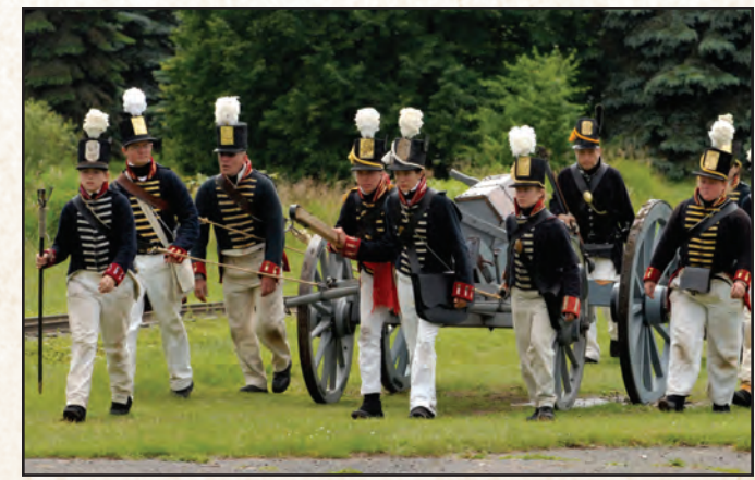
Young reenactors illustrate the physical demands placed on the troops.

In some ways, the War of 1812 looked more to the past than to the future. As America's second and last war against Great Britain, it echoed the ideology and issues of the American Revolution. It was the second and last time that America was the underdog in a war and the second and last time that the nation tried to conquer Canada. It was also the last time that Indians played a major role in determining the future of the continent.