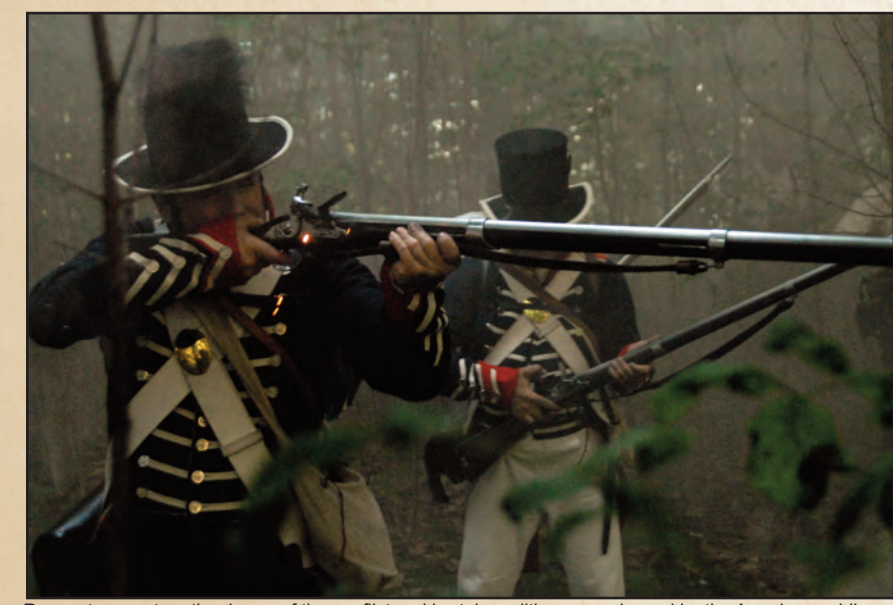
Reenactors capture the drama of the conflict and brutal conditions experienced by the American soldier

Another reason for the obscurity of this war is that its causes are complex and little understood today. Most scholars agree that the war was fought over maritime issues, particularly the Orders-in-Council, which restricted American trade with the European Continent, and impressment, which was the Royal