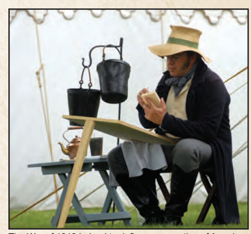
he War of 1812 helped to define a generation of American

after the war. The war also broke the power of American Indians and reinforced the powerful undercurrent of Anglophobia that had been spawned by the Revolution a generation before. In addition, it promoted national self-confidence and encouraged the heady expansionism that lay at the