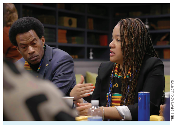
Saturday, April 6 at 8:30 p.m. on WETA PBS