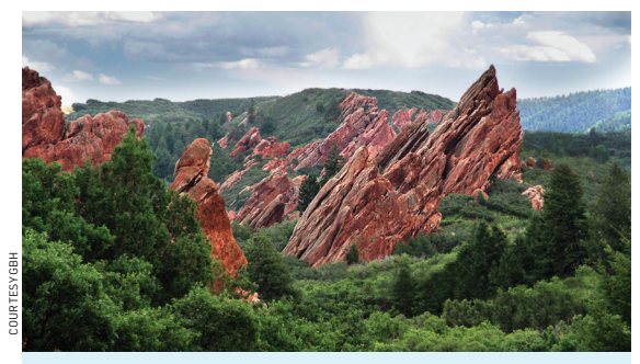
Wed, April 17-May 1 at 10 p.m. on WETA PBS & WETA Metro Three-part NOVA series Making North America presents a sweeping biography of the continent. Above: Roxborough State Park, Colorado.

decade since their great romance started, Jack and Alice face their greatest obstacle. Their relationship has survived everything thrown their way but with the greatest battle ahead, can love overcome everything?