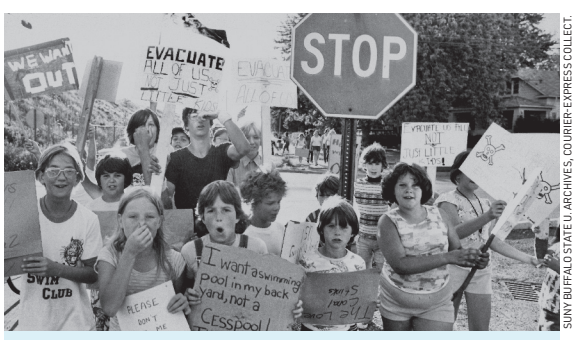
Monday, April 22, 9:30 p.m. on WETA PBS (9 p.m. on WETA Metro) American Experience: Poisoned Ground: The Tragedy at Love Canal explores a notorious U.S. environmental and public health disaster. Above: Love Canal youth-residents hold protest signs, June 1980.

11:00 GREAT PERFORMANCES: NOW HEAR THIS: THE VIR-