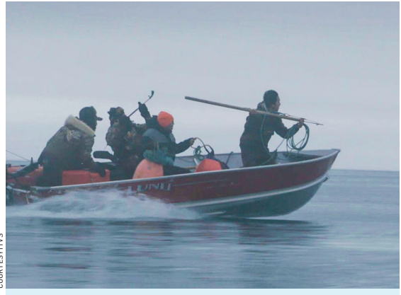
Tuesday, April 23 at 10 p.m. on WETA PBS & WETA Metro In Independent Lens: One With the Whale, an Alaskan family faces online attacks surrounding their ancestral practices when animal activists target its son, who harpooned a whale for his village.